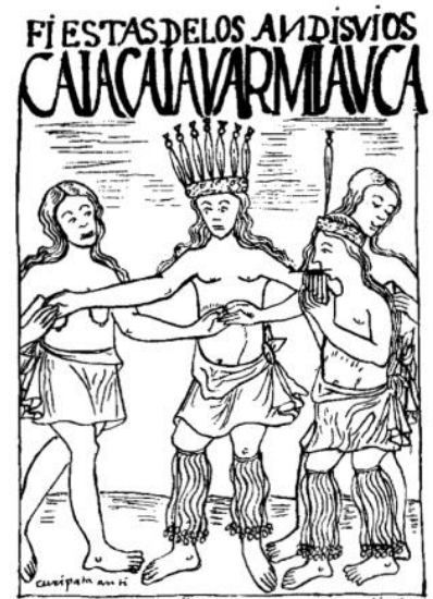
Figure 1 Guaman Poma de Ayala. “Fiestas Antisuyos” (1615)